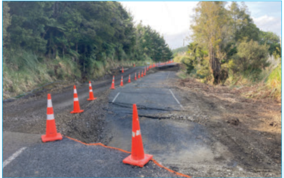
Repairs to two major slips on West Coast Road are expected to start early this year but may take some time. A detour remains in place for heavy vehicles at the Kohukohu slip.

Waka Kotahi has approved funding for geotechnical assessments and detailed designs. However, residents are warned work will take some time to complete.