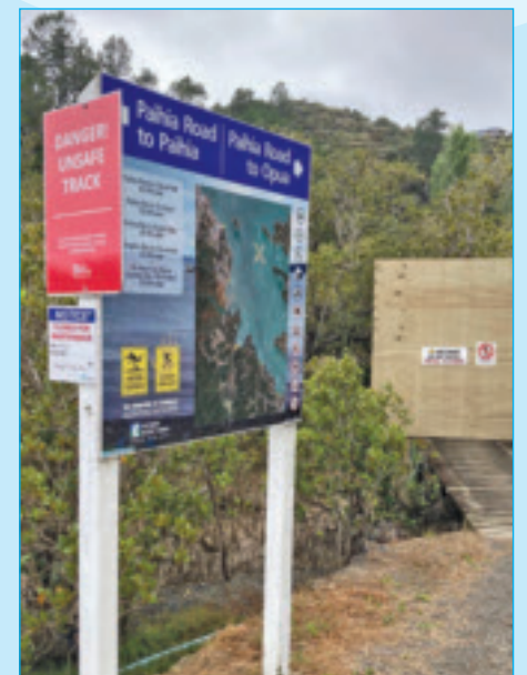
A popular coastal walking track has reopened, but more work is taking place in January.

However, further work on the structure is required by council contractors. The boardwalk and bridge will close on weekdays during January to allow for the installation of permanent safety rails and other work. The boardwalk and bridge will open at weekends during this time.