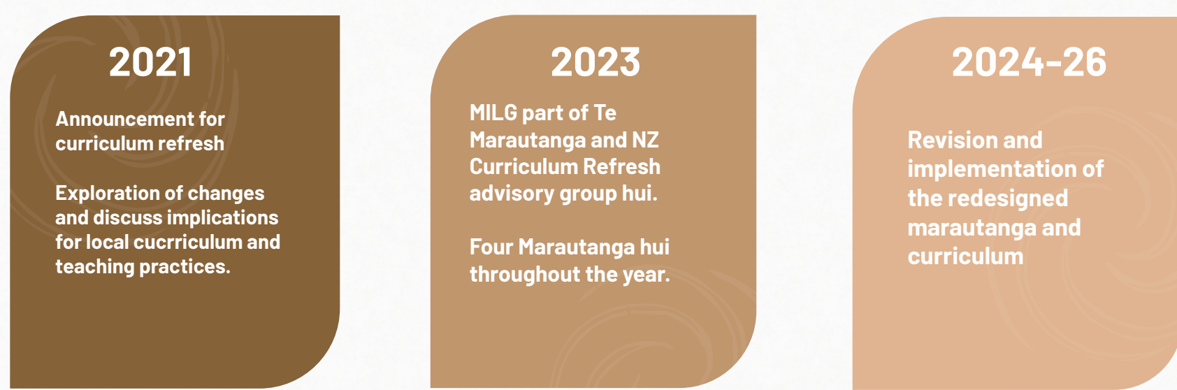
Timeline for curriculum redesign

To learn more, click here or if you have any pātai, please contact milg@ngatiraua.iwi.nz.